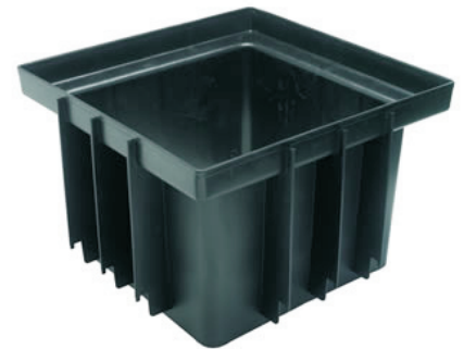
EH600 Collection Pit

When being used in trafficable areas, the EH600 collection pit must be installed with a concrete collar to fully support the top of the pit. This collar should be a minimum of 150 x 150mm around the top perimeter of the pit. A support brace is provided and when fixed as per instructions, will prevent deformation of the pit during back fill procedures. The support brace can be re-moved after installation is complete.